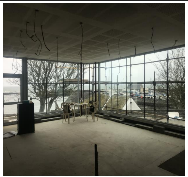
View out of the Coffee Bar