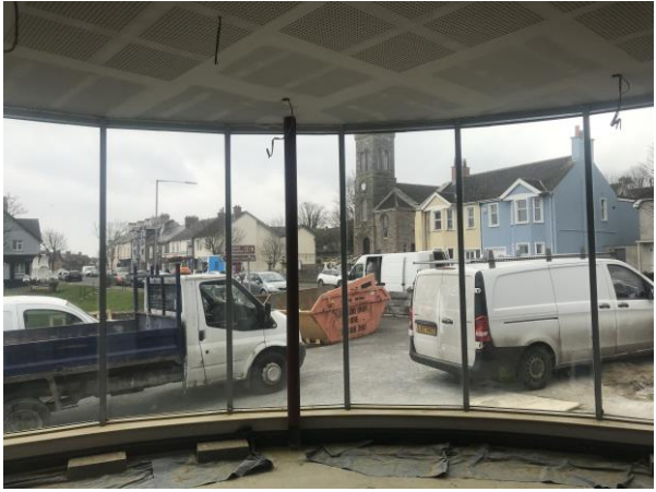
View from inside the Entrance Foyer.